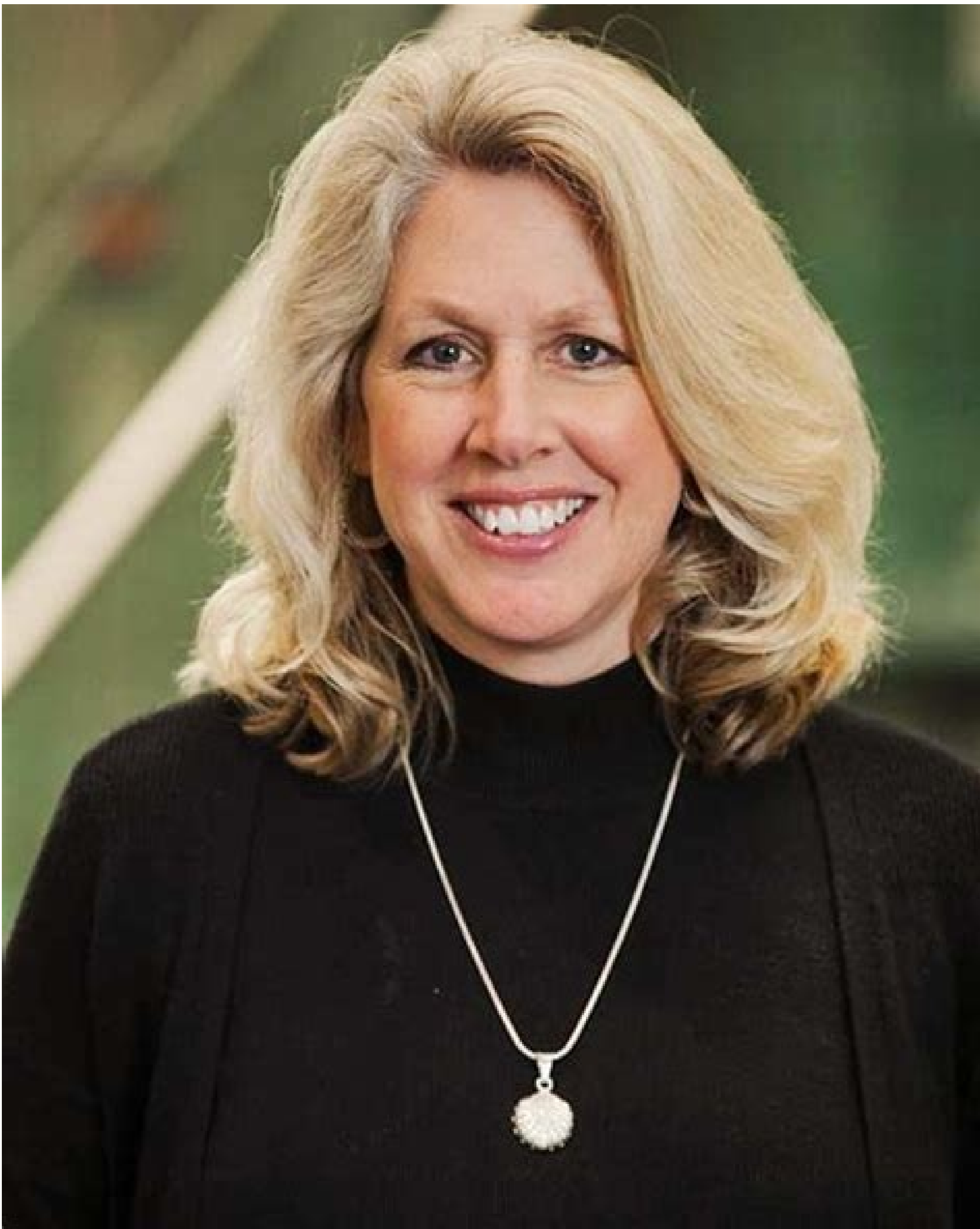
Ohio attorney general 2020 sunshine law manual.